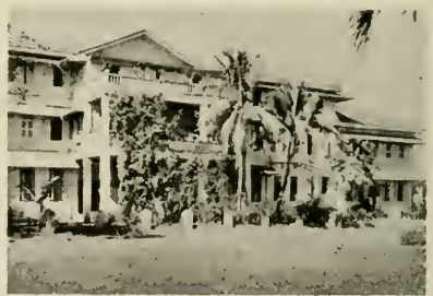
Mary Johnston Hospital, Manila